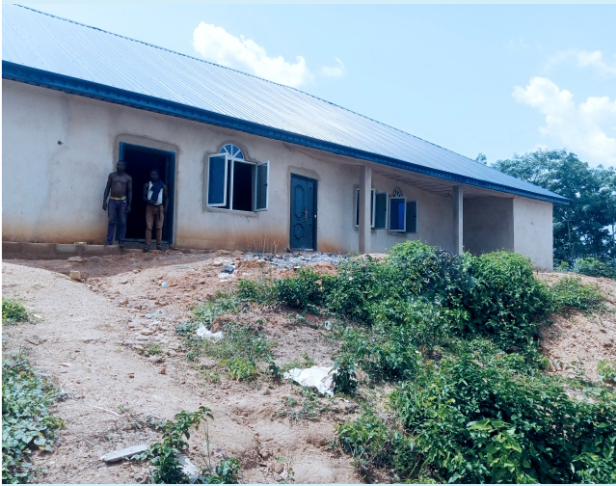
Construction, Furnishing & Donation of Mary Slessor Chapel to The Presbyterian Church of Nigeria at Use Ikot Oku, Ibiono Ibom LGA, Akwa Ibom State, where Mary Slessor died